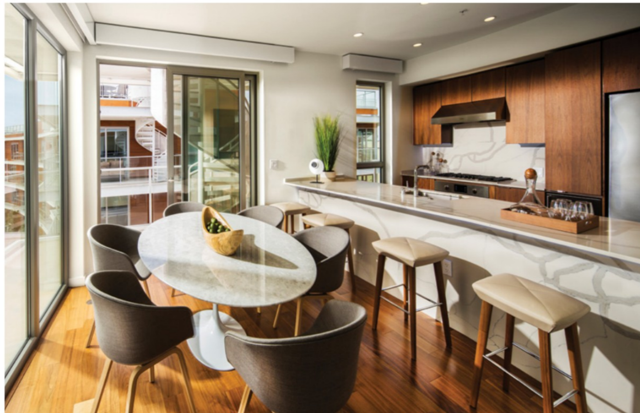
▲ The Residences at Pacific City attract a range of buyers from empty nesters to young families.