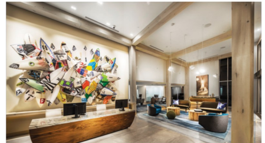
▲ There is a total of 516 residences in the Residences at Pacific City community.