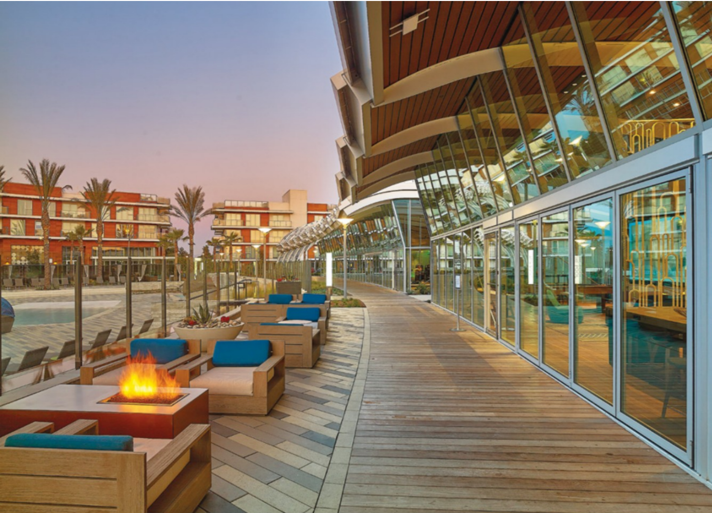
▲ The amenity center also incorporates stand-out ocean-themed design details.

What better place to have architecture that inspires and pays respect to the ocean and surfing lifestyle.”