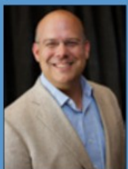
Gregg Walker Sustainable Solutions