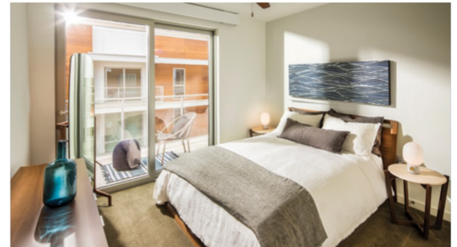
▲ Each unit offers indoor/outdoor living design and sustainable features.