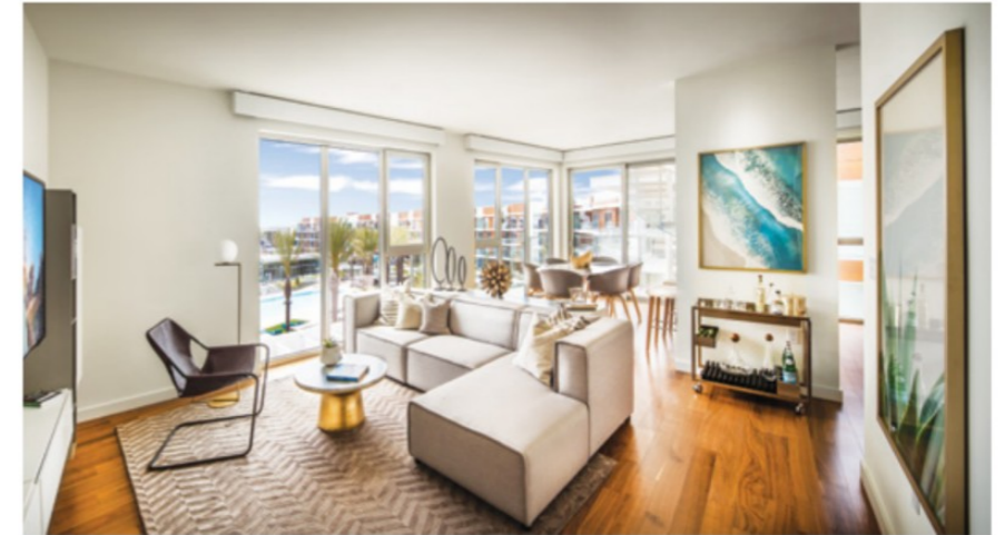
▲ Residential units offer an abundance of natural light and floor plan width.