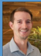
Asa Foss Sustainable Solutions