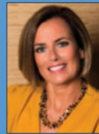
Mary Cook Architecture & Design