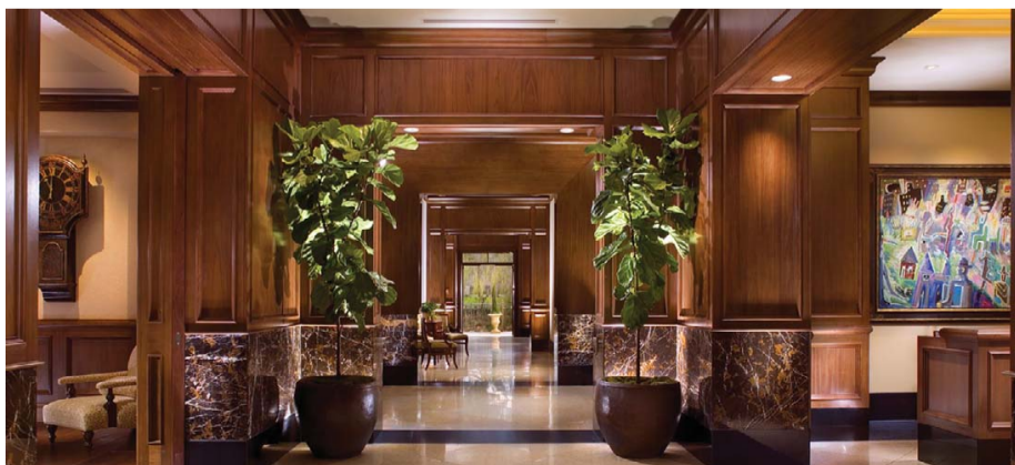
Interior work includes refresh of 30K-SF Pacific Club in Newport Beach