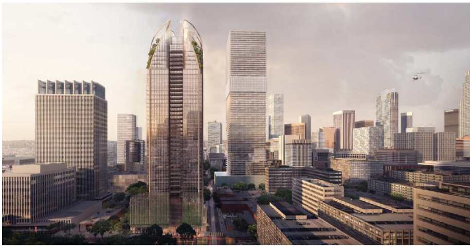
1111 Hill Street Tower was a springboard to other high-rises in LA