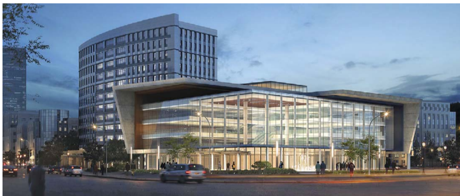
Prior work in Wuhan totaled 10M SF

"It's a little bit more difficult to be collaborative on a computer at home." ■