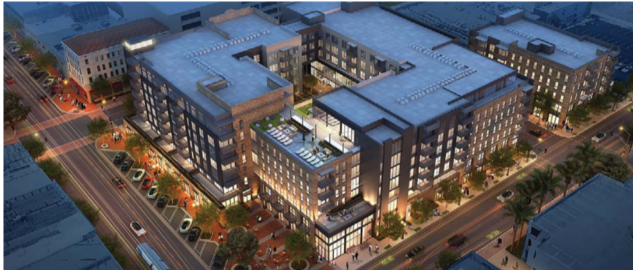
4th & Main: pair of 7-story residential towers planned in downtown Santa Ana

MVE is continuing its work in Orange County.